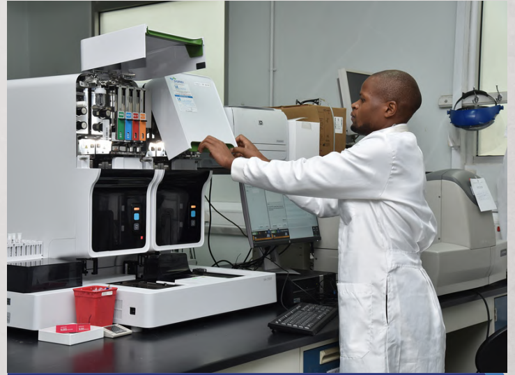
State of the art Lab equipment.