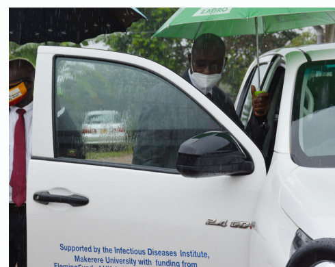
A project motor vehicle was handed over to NADDEC to offer full-time support to the sample transportation at the microbiology laboratory and Antimicrobial resistance (AMR) National Coordinating Centre.

The National Veterinary Microbiology Reference Laboratory is undergoing renovation to enforce international biosafety standards.