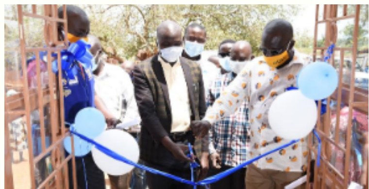
Handover of ART facility at Alwi HCIII

The facilities will be able to provide services such as counselling, laboratory services, exclusive patient record management and pharmacy. The facilities now have well-spaced and aerated waiting areas and this will reduce the risk of patients contracting respiratory diseases such as TB.