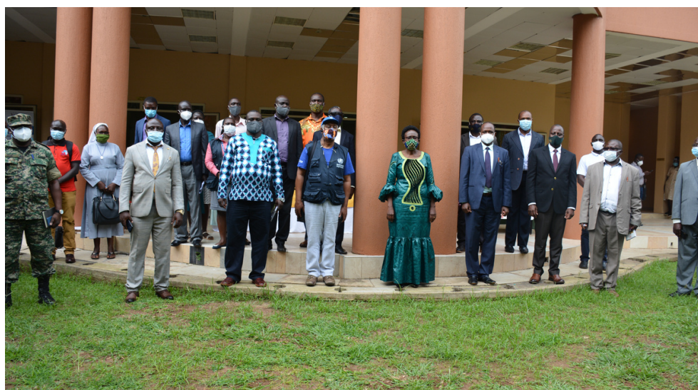
Hon Minister of Health - Jane Aceng (centre) with the IDI team after commissioning of the EOC at Mbale Regional Referral Hospital

American global public health organization, Vital Strategies. IDI created a "Surge Team" which comprises of; the technical people, politicians and the security. This team's role is to carry out a situation analysis of the response to COVID19 in the region. This centre is expected to strengthen effective coordination and response to outbreaks including COVID-19 and other public health emergencies within the 16 districts of the Eastern region.