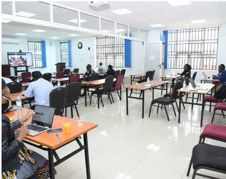
Individuals attending the 10-Day course virtually at IDI Makerere

In order to support set up of the MAT centre, a course was organised in collaboration with the Ministry of Health and Butabika National Referral Mental Hospital. It combined both theory and practical approaches to build skills and knowledge in MAT service delivery for PWIDs. Forty-two people successfully attended this course including health workers, CSO staff, and programme staff. Items worth USD50,000 including furniture, computers, audio-visual equipment, automated dispensers among other clinical supplies were also handed over to the centre.