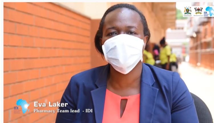
World Patient Safety Day