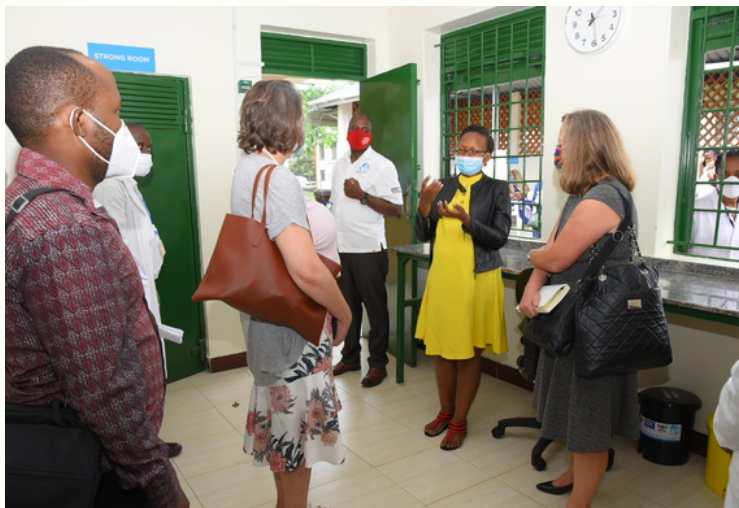
Delegates from the CDC touring the MAT centre at Butabika Referral Hospital