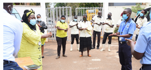
Staff taking part in the practical sessions during the IPC Training

The GHS team held an IPC training for Security and Sanitation personnel at IDI MKC and Mulago. This training included an overview on COVID-19, basic IPC measures and a practical session on hand hygiene and proper use of masks.