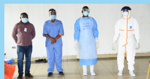
Healthcare workers attending the IPC training in Buvuma District

In the baseline, the team has carried out home-based care interviews for the vulnerable old, visited bodaboda stages, taxi parks and cases in home isolation based on the scope of work. The purpose of the activities is to spread awareness on the realities of COVID-19 in the communities.