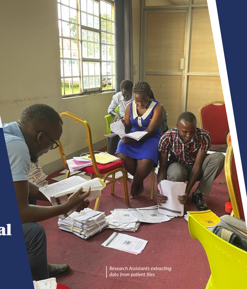
Research Assistants extracting data from patient files